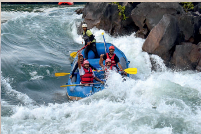
River Rafting, Dandeli