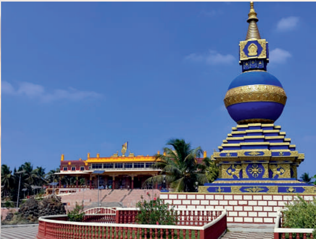
Mundgod Tibetan Camp