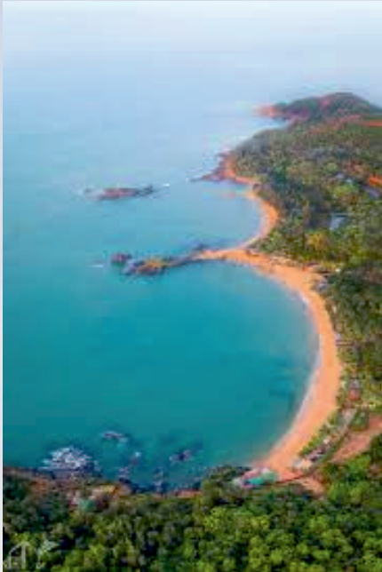
Om Beach, Gokarna