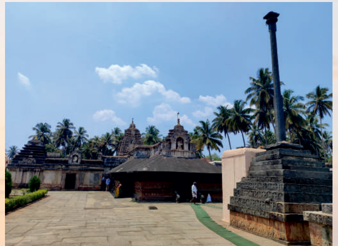
Madhukeshwara temple, Banavasi