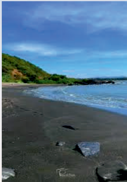
Tilmati Black Sand Beach, Karwar