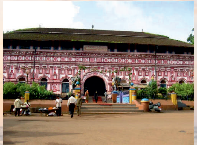
Marikamba Temple, Sirsi